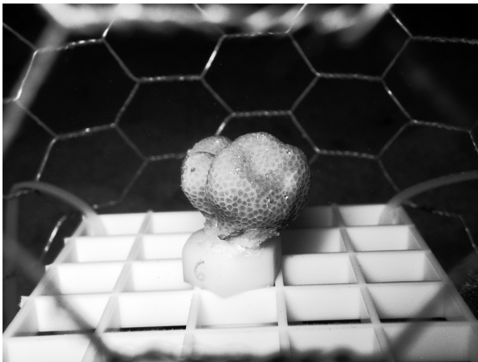
PLATE 1. The experimental unit in the field, consisting of a juvenile Porites coral glued to a nylon bolt and fixed to a plastic grate above the nutrient-diffusing cup (not pictured). The unit was protected from coral predators using a 2.5-cm-mesh galvanized steel cage.

the growth rate of an organism is optimized at an intermediate nutrient intake (Fig. 2; Barboza et al. 2009). Previous studies of coral interactions with zooxanthellae, their endosymbiotic algae (in the genus Symbiodinium ), may provide a mechanistic explanation for the unimodal pattern observed: when zooxanthellae production is limited by nutrients, nutrient enrichment may increase zooxanthellae photosynthesis and, in turn, increase the amount of carbohydrates transferred to the coral host (Hoegh-Guldberg and Smith 1989, Muller-Parker et al. 1994, Dunn et al. 2012). In contrast, under higher nutrient concentrations, carbon (and not nutrients) may become most limiting. Thus, competition between the zooxanthellae and coral can reduce the amount of carbon provisions to the coral host, depressing coral growth (Dubinsky et al. 1990, Falkowski et al. 1993). Increased expulsion of zooxanthellae by corals and decreased lipid content of coral mucus under elevated nutrients further suggest that zooxanthellae may shift from being mutualists to parasites under certain nutrient scenarios (Stimson and Kinzie 1991). A similar pattern of “mutualism to parasitism” has been observed in plant–mycorrhizal fungus associations (Hoeksema et al. 2010). Further work is needed to clarify how potential mechanisms (e.g., due to zooxanthellae physiology assessed via PAM fluorometry [Schreiber 2004] or due to changes in coral–microbe